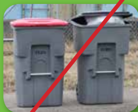
Carts too close together