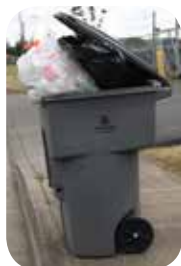
Extra will be charged.