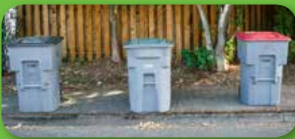
Carts -- placed 4 feet apart