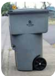
OK (no extras)

Please place loose items in bags or boxes. We charge for extra trash if the cart is over-full and the lid cannot close.