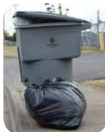
Extra will be charged - extra trash is bagged.